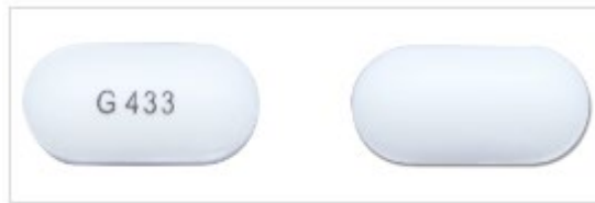
Image of US tablet